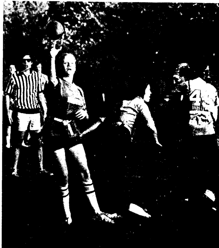
Lyons and Lewis were winners in last week's women's interhall action.

The present standings of Women's Interhall Football are: Lyons 4-1, Lewis 4-1, Walsh 3-2, Farley 1-4.