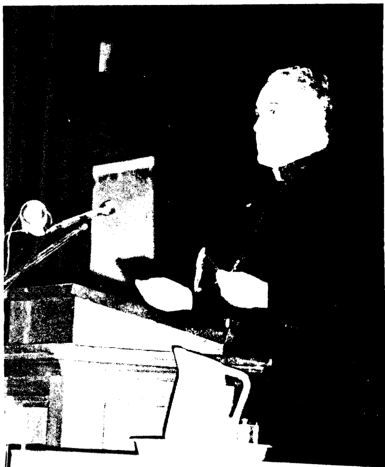
FR. HESBURGH predicted that changes will come and confront mankind with moral challenges in his annual faculty address.