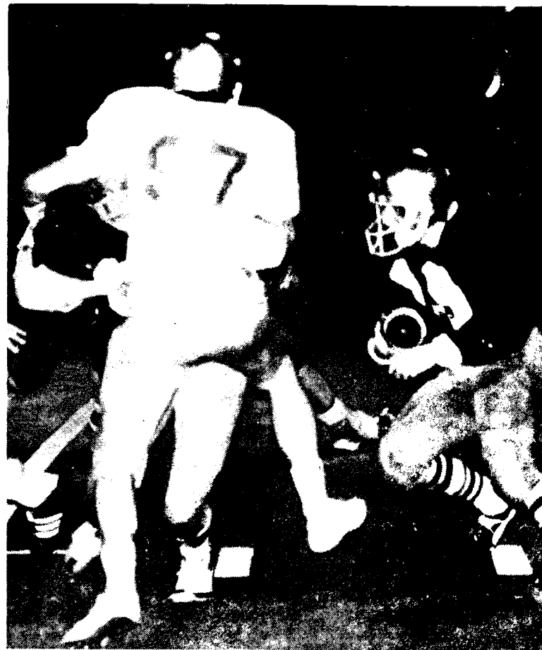
Rain and the wet surface hampered play over the weekend.

This game was scoreless until late in the fourth quarter when, after just stopping a Flanner drive, Zahm fumbled deep in their own