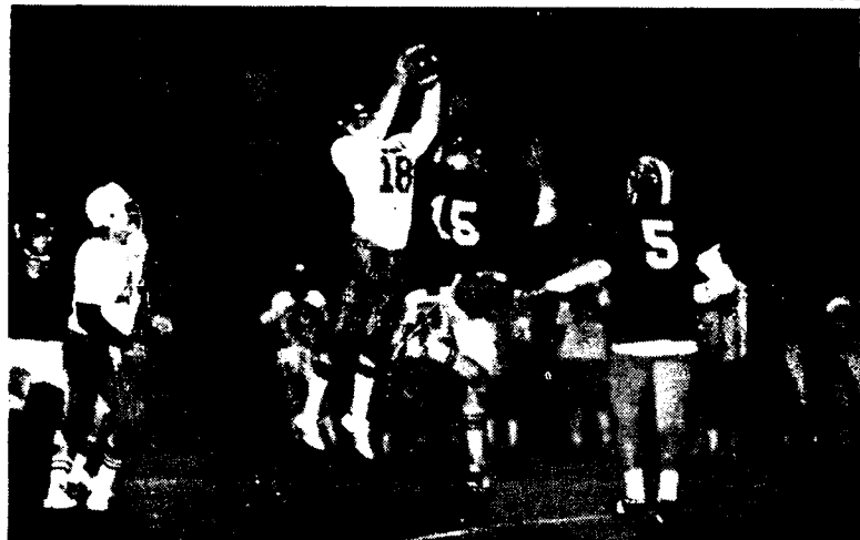
Keenan remained the only unbeaten interhall team by downing Cavanaugh 20-0 Sunday