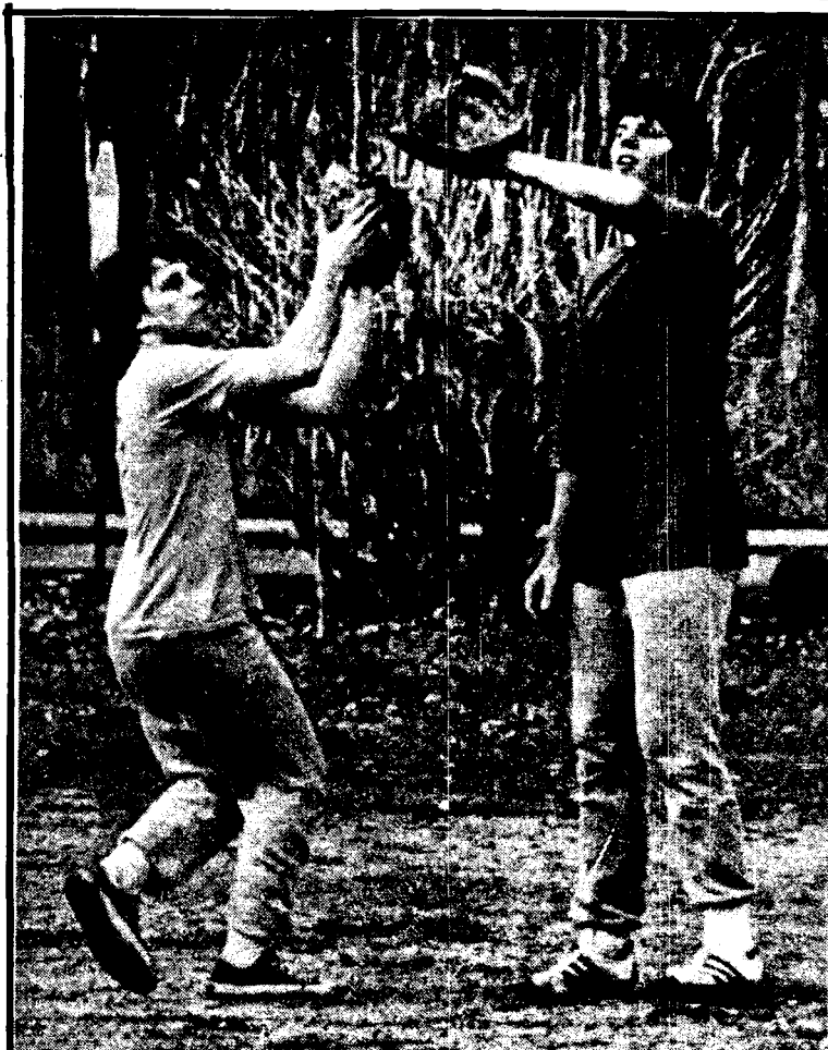
A WISH AND A PRAYER?: These outfielders approach the ball in different ways- [1] eyes closed, glove protecting the face; and [2] ball away from the body, acrobatic. Method 2 prevailed on this play

He also said he gave a wedding present in 1975 of $1,000 in Korean currency to Rep. Charles Wilson, D-CA. Park said he has been told that Wilson asked an officer in one of Park's companies to exchange the money for American dollars.