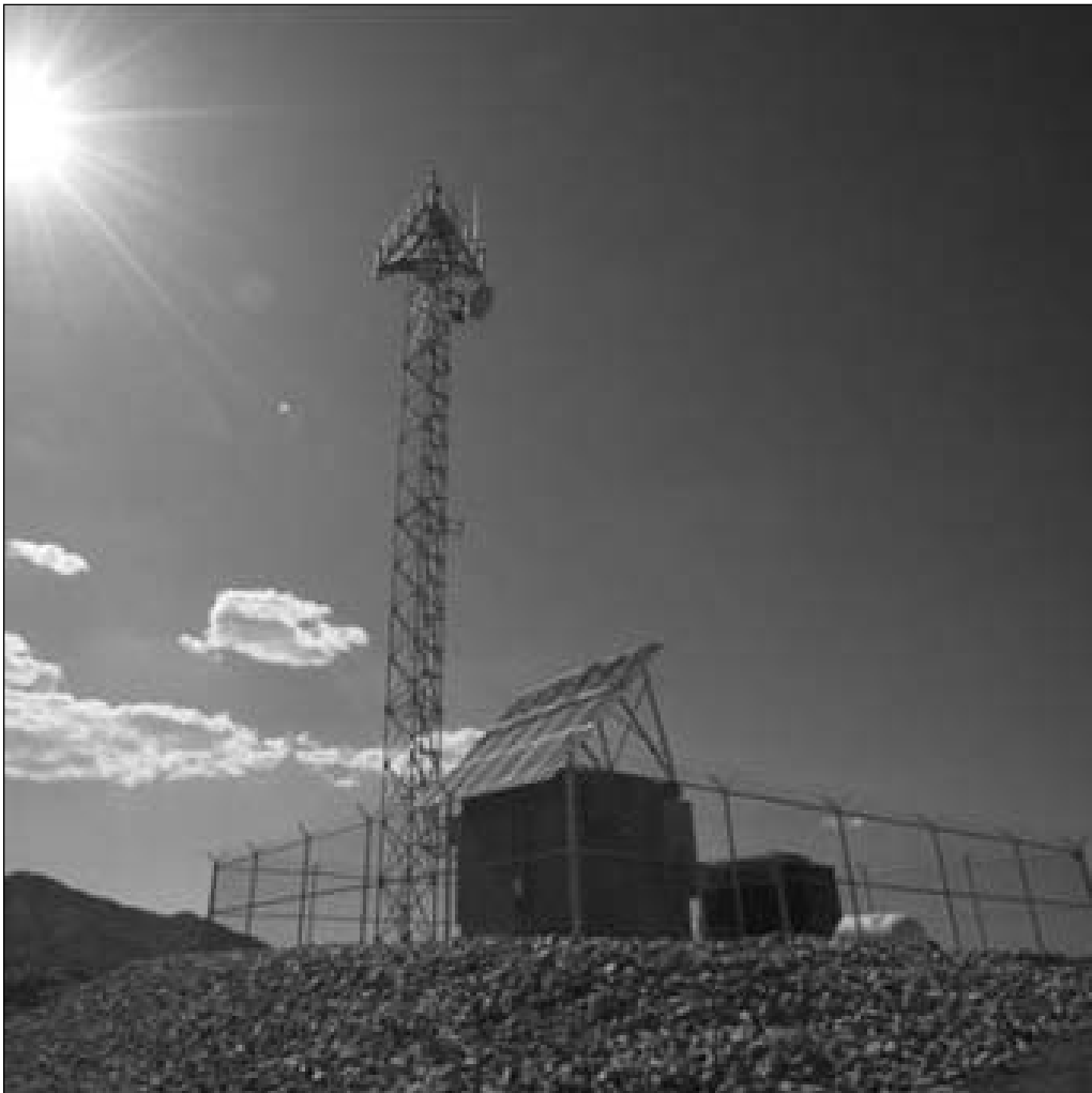
This undated picture provided by the U.S. Customs and Border Protection shows a prototype of a tower for a virtual fence along the U.S.-Mexico border at a test facility in Playas, N.M.

The system was supposed to let a small number of dispatchers watch the border on a computer monitor, zoom in with cameras to