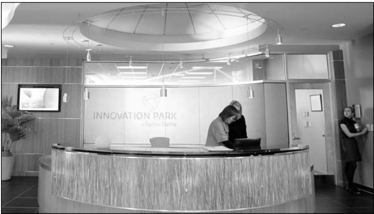
Current Notre Dame faculty and students helped found two of the businesses established at Innovation Park. The building's lobby is shown here.