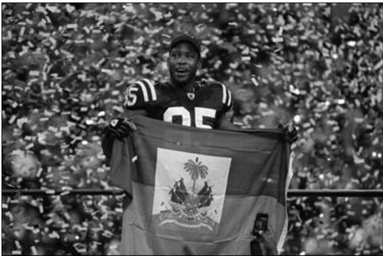
Colts receiver Pierre Garcon holds up the Haitian flag after the Colts' 30-17 win over the Jets in the AFC Championship.