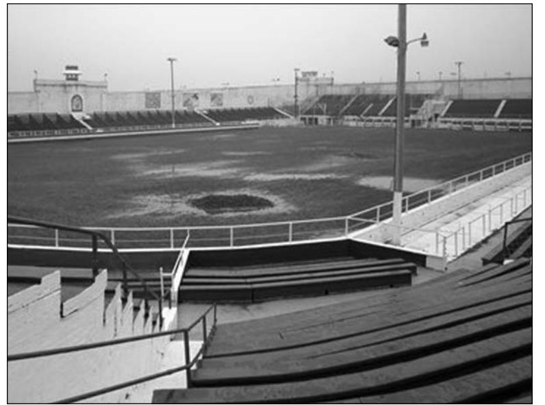
The state penitentiary in McAlester, Okla., offers an annual inmate rodeo in this arena. This year, the rodeo will not be offered due to budget cuts.

Inmates grow equally excited, and are eager to strut their stuff in front of their sweethearts, some who traveled hundreds of miles to see them. Out of the 1,000 inmates at McAlester, only about 100