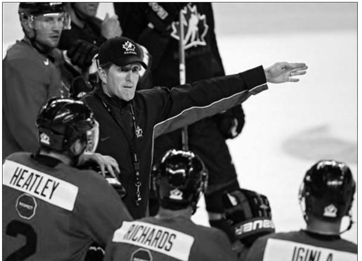
Canada head coach Mike Babcock instructs players during the Olympic hockey orientation camp in Calgary, Alberta.

Several of Babcock's players were asked a couple weeks before the Vancouver Games begin for their impressions of him