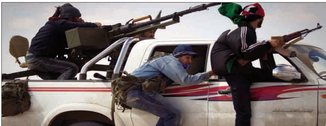
Libyan rebels retreat from the eastern Libyan city of Ajdabiya, south of Benghazi, under mortar fire from General Mommar Gaddafi's forces.