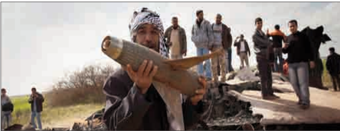
A Libyan man poses with wreckage from a US F15 fighter jet. The aircraft crashed outside of the village Bu Mariem in an open field.