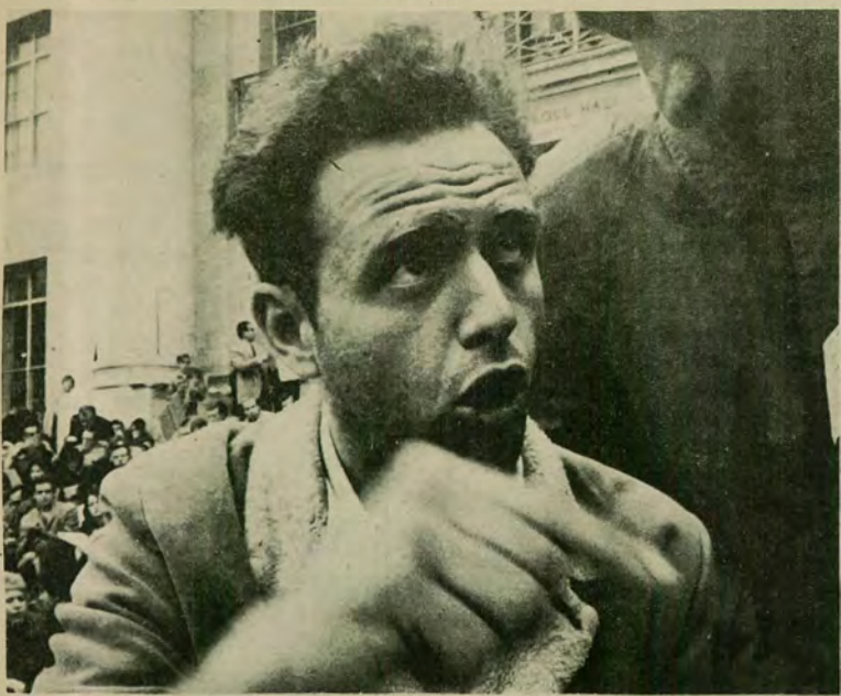
MARIO SAVIO AND FREE-SPEECHERS

An independent political community is being built in this country which has the power to sustain those who want to challenge the great Johnsonian consensus or who want to at least partially dislodge themselves from the tyranny of the institutions on which they are dependent for work.