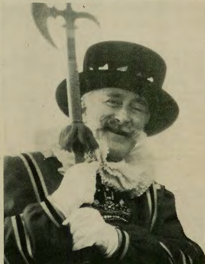
Beefeater - London