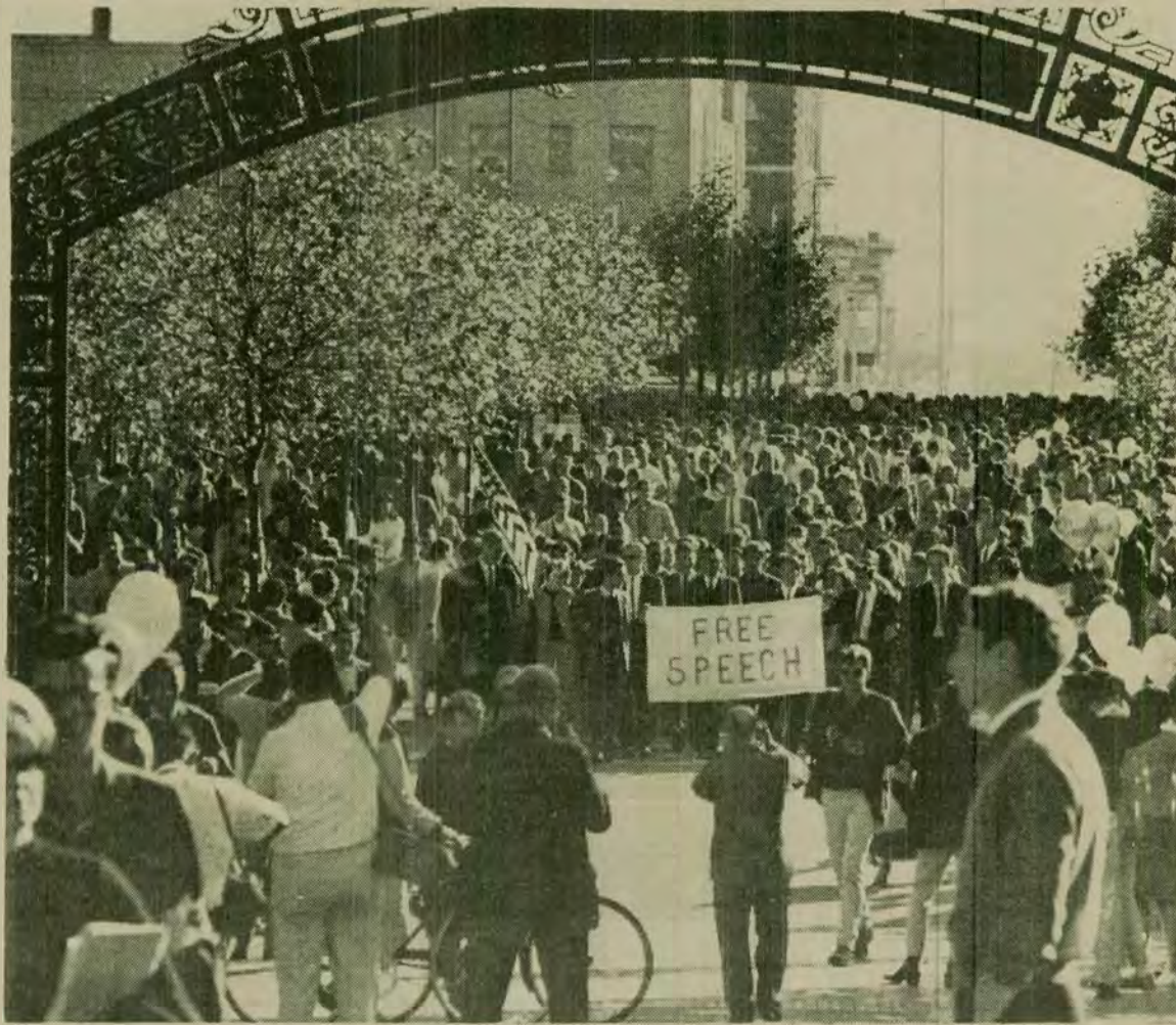
FREE SPEECH MOVEMENT MOBS BERKELEY

The myth of the great American middle class, which projected the image of an endless prosperous suburb, could be counterposed to the fact that 30 million Americans still live in poverty. Students could begin to appreciate the irony of being called "rabble" by the