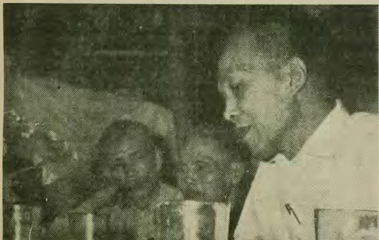
Non-Communist Chairman Nguyen Huu Tho of the South Vietnam National Liberation Front with advisors.

"I was a millionaire before I ran for public office!"