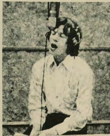
The voice and character of Mick Jagger have kept the Rolling Stones in the pop music limelight.

The latest reaction (for many pop fans who like neither bubblegum or cornpone music) has been referred to as the Credence Clearwater Revival (after the group most successful at it) This is the revival of a rock music not unlike that of the fifties. Fats Domino made a comeback of sorts, the Rolling Stones changed back to their old rock style, and Cat Mother & the All Newsboys struck with the single That Good Old Rock & Roll . The Credence Clearwater Revival, first hitting with Suzy Q. has not been able to be stopped in their quest for the top of the tunedex with their solid rock & rollicking.