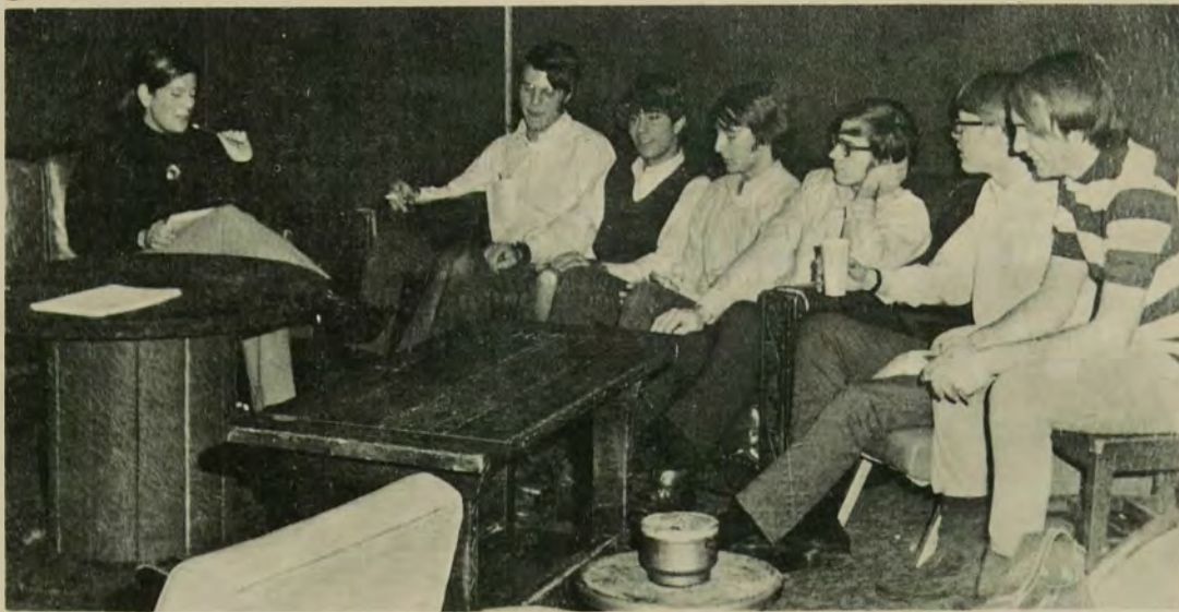
Student Arts Festival members at last night's first organizational meeting.

If all runs smoothly the SLC meeting tomorrow will conclude with the Chairman's Report on the shuttlebus and the proposed disciplinary fines.