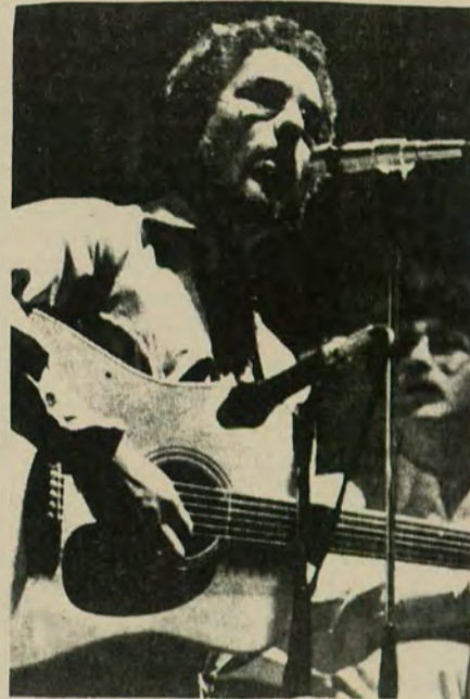
Bob Dylan helped folk music move into the rock age, but moved back to a simpler country sound with John Wesley Harding and Nashville Skyline.

audience wanted escape from the harsh reality of the world and they weren't getting it.