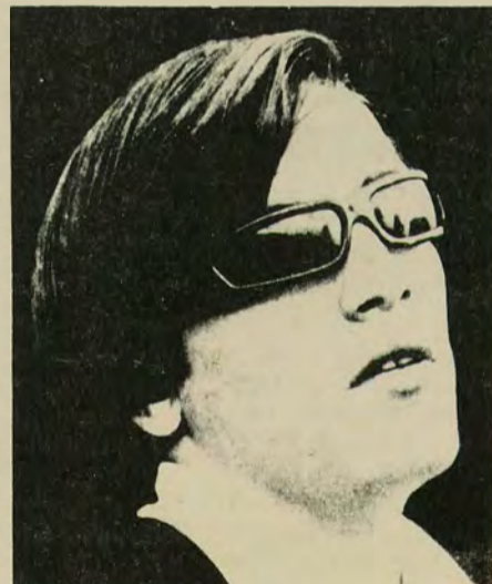
Jose Feliciano's unique style was an overnight success in 1968.

The cry for relevance continued and in 1968 developed into what has been called heavy, progressive, or underground music. The musician had to play what he felt was important to him. If it was important to no one else, that didn't matter, as long as the musician got something out of it. Most occasional pop listeners couldn't understand or identify with this good underground music, and it looked like pop music was on the skids again. The