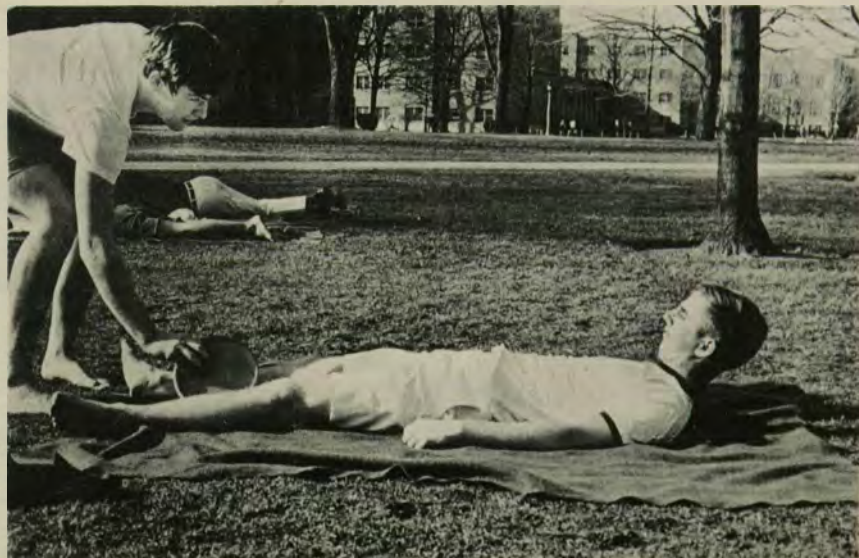
Frisbee season was officially opened yesterday. If you're on the quad in the sun: watch it.

the jury, only one of the twelve under forty, has given its verdict, but the truth comes from their peers in the streets: in chicago: innocent, for reasons of conscience. in milwaukee: acquitted, to continue fighting oppression. in seattle, not guilty, for upholding life. in washington, freed, to continue the struggle.