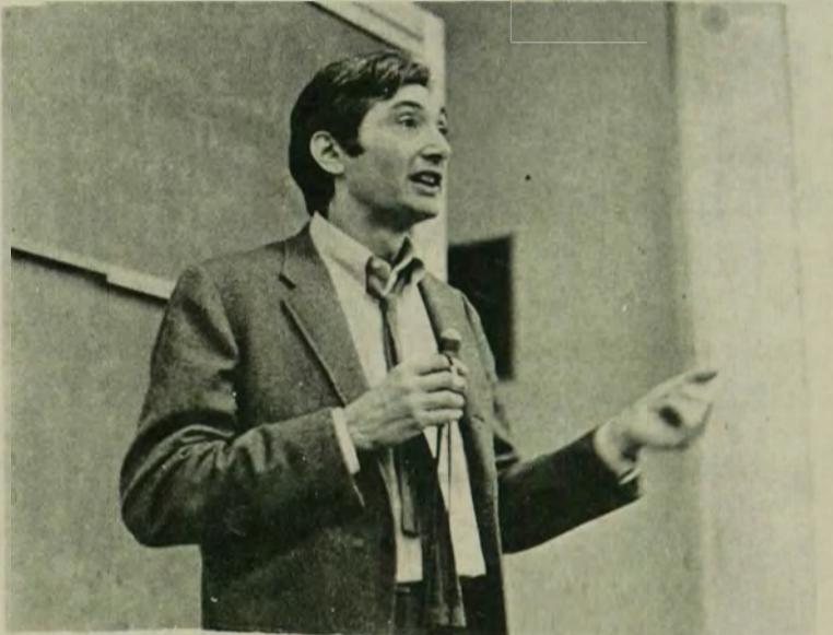
Howard Zinn told a large audience last night that America rationalizes poverty, racism, and war.

ployees here. They were busy diverting foreign mail to other ports, emptying out street mail boxes and putting "temporarily closed" signs on them, inspecting packages for perishable material that must be destroyed, and locating lifesaving drugs for hospitals.