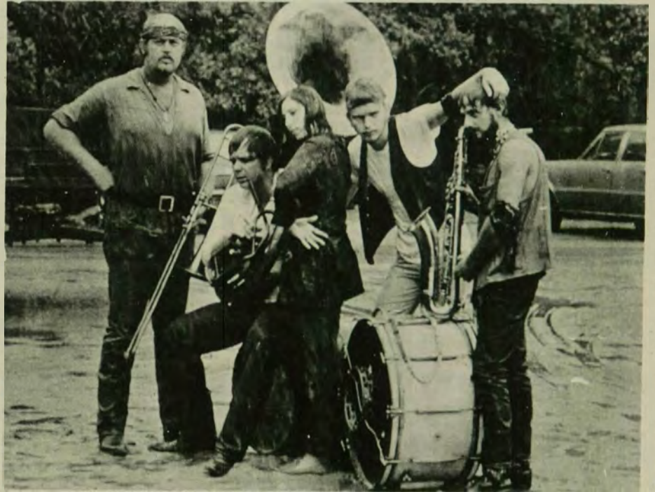
The Observer features staff, shown as they gathered this morning to welcome the arrival of another beautiful South Bend spring. After frolicking among the trees, the happy group settled down for their annual cumquat picnic, followed by a joyous do-it-yourself music festival.

At $4.50 for an all-session ticket, it comes to about $.50 an hour for the best music you'll hear on campus this year. If you don't go, you miss a lot. If you do go, you'll enjoy yourself. So go!