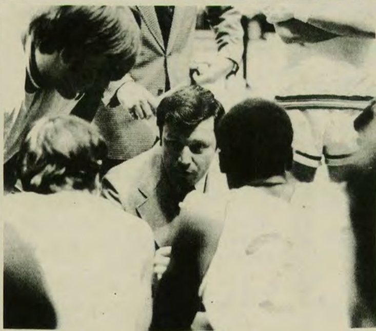
Digger Phelps and his Fighting Irish will be plotting how to end a six-game losing streak tonight against West Virginia.