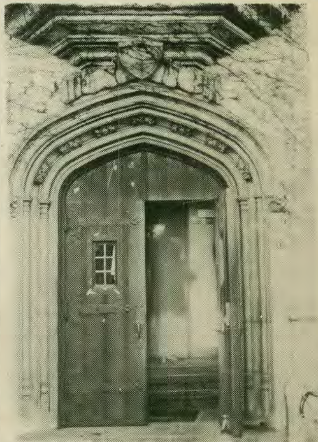
Alumni Hall: Card control access foiled by robbers.