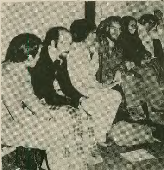
Hall Presidents discuss constitution veto

All elections were suspended in a government declared "martial law" while a "committee of in-