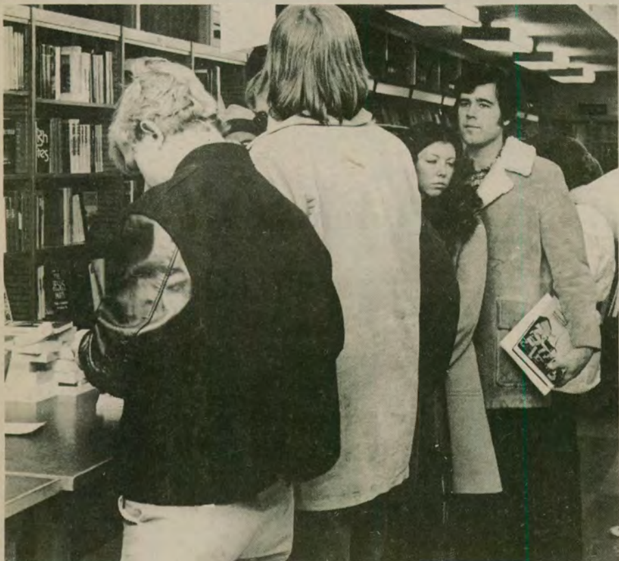
TYPICAL EARLY-SEMESTER hassles at the bookstore are displayed in this crowd and waiting line.