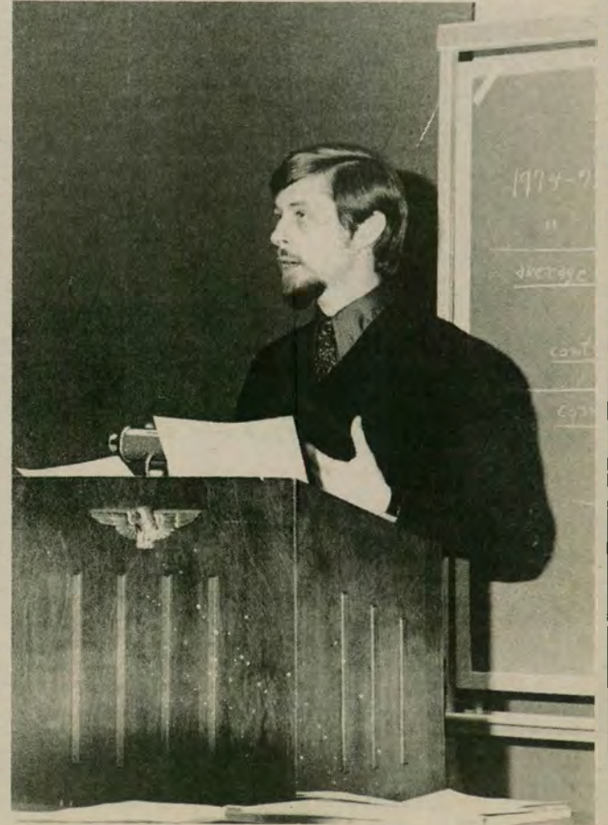
THE FACULTY Senate met last night in first '75 session, amending and passing six items.

The Senate will also consider the issue of collective bargaining for faculty members.