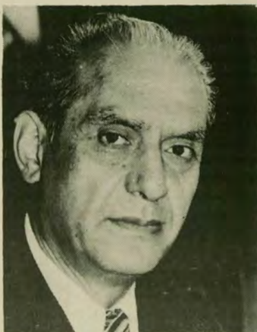
CONGRESSMAN ROYBAL will speak tonight in the library auditorium on Congress and its relation to minority groups.

Roybal has been a strong supporter of federal public works programs and federal spending for schools, poverty programs, and urban renewal. He voted for the 1967 anti-poverty bill funding the Office of Economic Opportunity with $1.75 billion dollars. He also