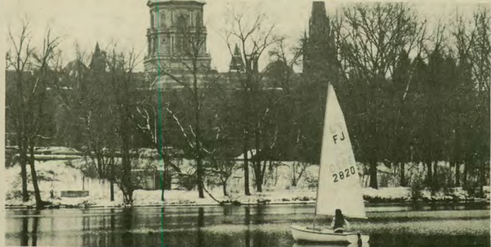
ALTHOUGH IT may still be winter, this sailboat is proof-positive that spring is not far away (Photo by Tom Lose).

While St. Mary's looks forward to developing a sports program in its new gym, Notre Dame is concentrating on improving communication with itw own female contingency.