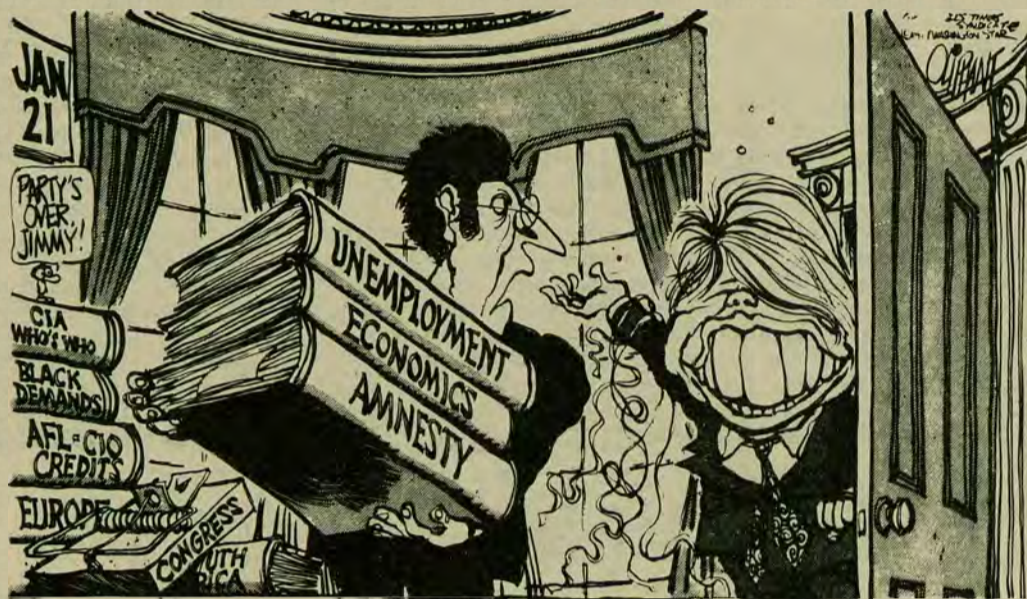
"GOOD MORNING, MR. PRESIDENT... AND YOU CAN STOP SMILING NOW!"