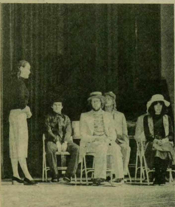
The Second City, one of Chicago's finest comedy acts, returned to O'Laughlin Auditorium for the second time this school year and entertained the overflow crowd with two hours of outrageous satire.