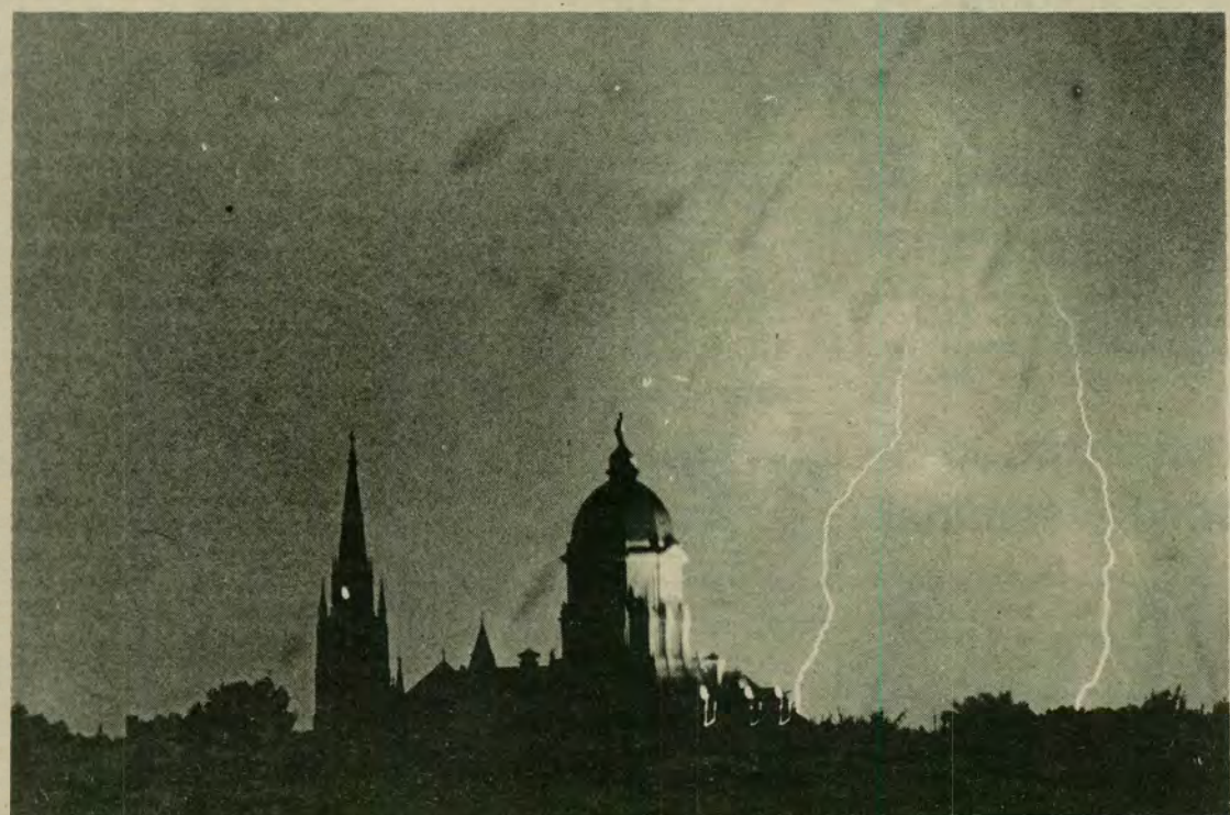
Friday's thunderstorm threatened the football weekend, but the rains subsided for the duration of the first home game.