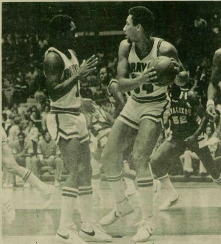
"I wasn't trying to steal it," intimates Tiny Archibald, as he faced John Shumate at the ACC.

Information regarding the actual distribution of the student tickets, tickets to the Nov. 18 Russian game and tickets to the games played during the vacations will be forthcoming.