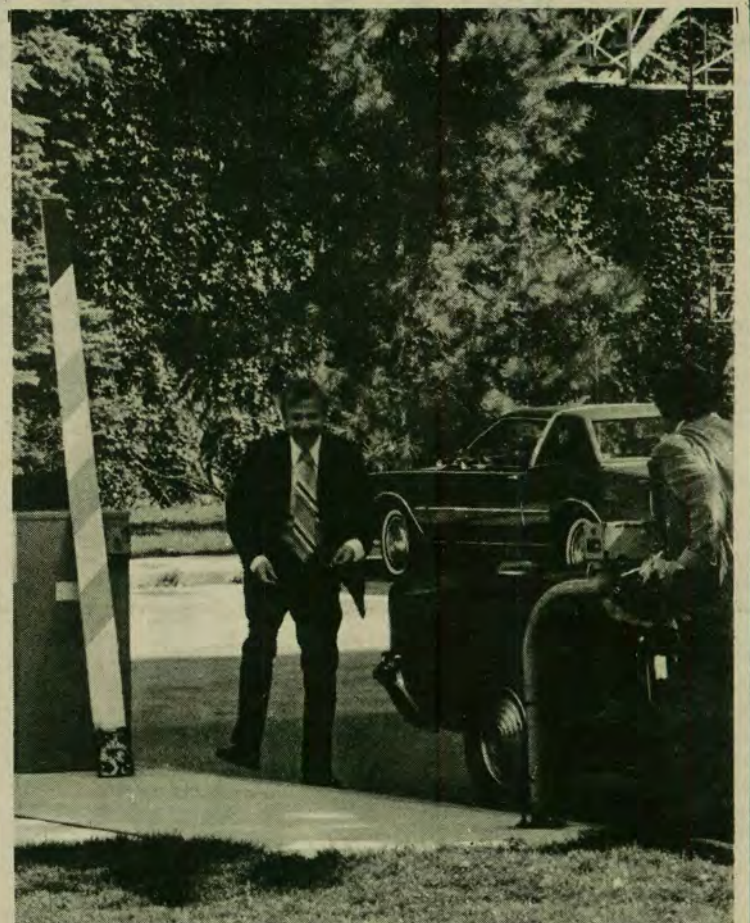
Sometimes a pass won't even help! This faculty member found the solution to his problems...remove the gate!