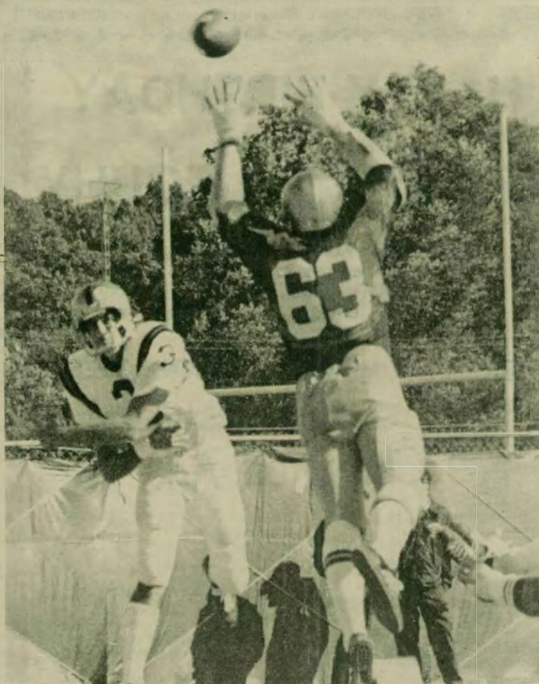
This leaping defensive end typifies the intensity of play Saturday, as the Irish nailed Purdue, 34-0.