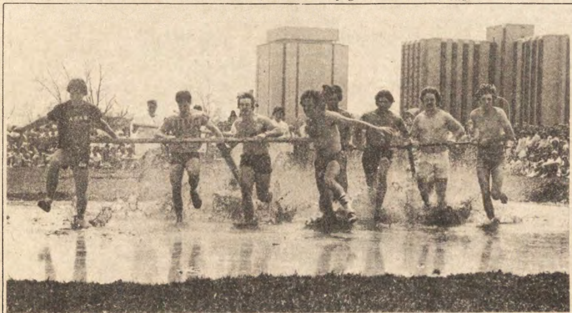
Brave charioteers storm through the Mud Pits in last Saturday's Ben Hur Race.

The lecture is sponsored by the Medieval Institute of Notre Dame and all students and faculty are invited to attend.