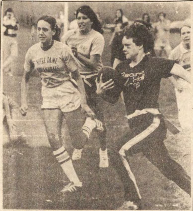
Lewis Hall shut down Regina Hall 20-0 in the women's flag football championship.