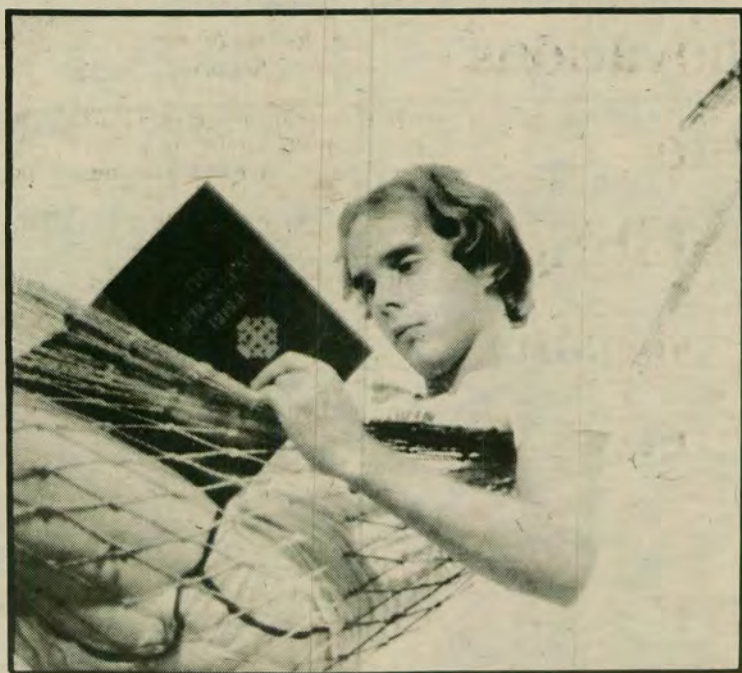
This student has found an ideal way to combine his studies with enjoyment of the late summer sunshine.

on sale Wed. Sept. 5th 9:00 am at Student Union Box Office Also available at ACC Gate 10 9:00-5:00