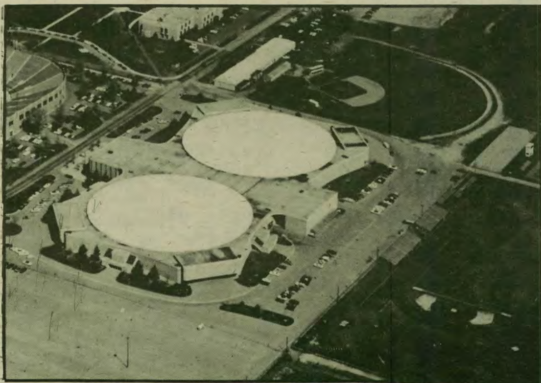
The Notre Dame ACC was the site of alleged brutality against vendors last week.