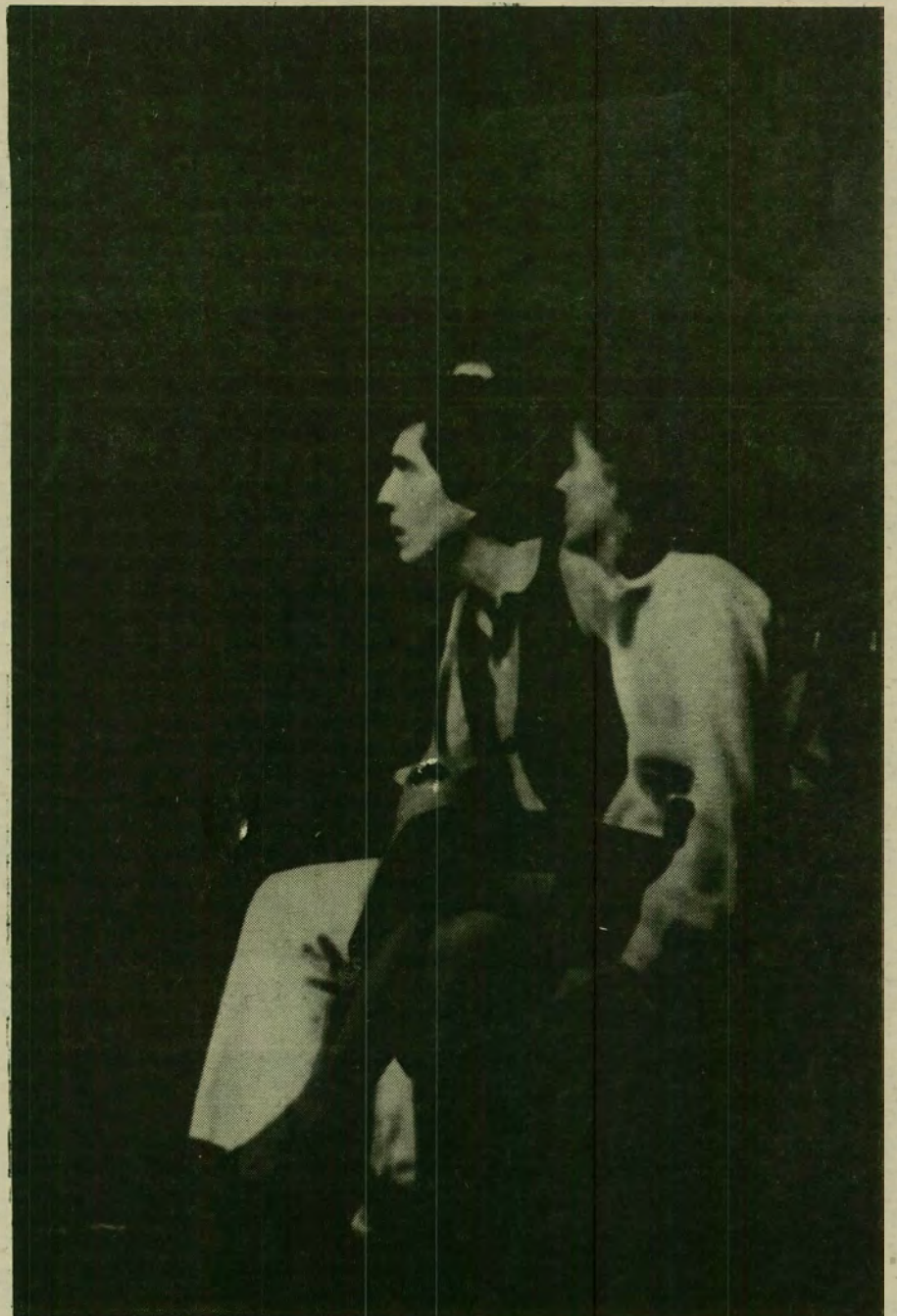
"Second City" performed this past weekend in O'Laughlin Auditorium at Saint Mary's.