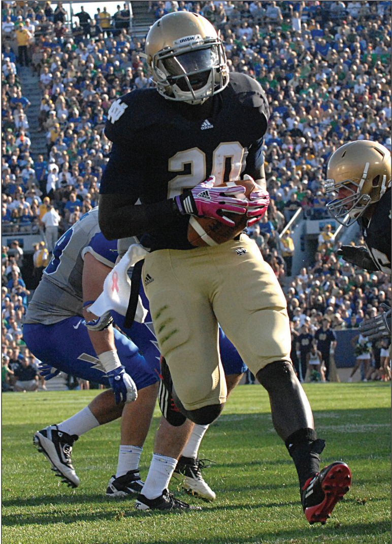
MACKENZIE SAIN/The Observer