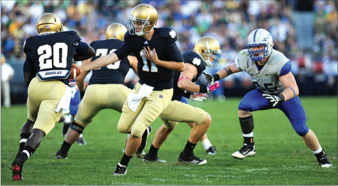
MACKENZIE SAIN/The Observer