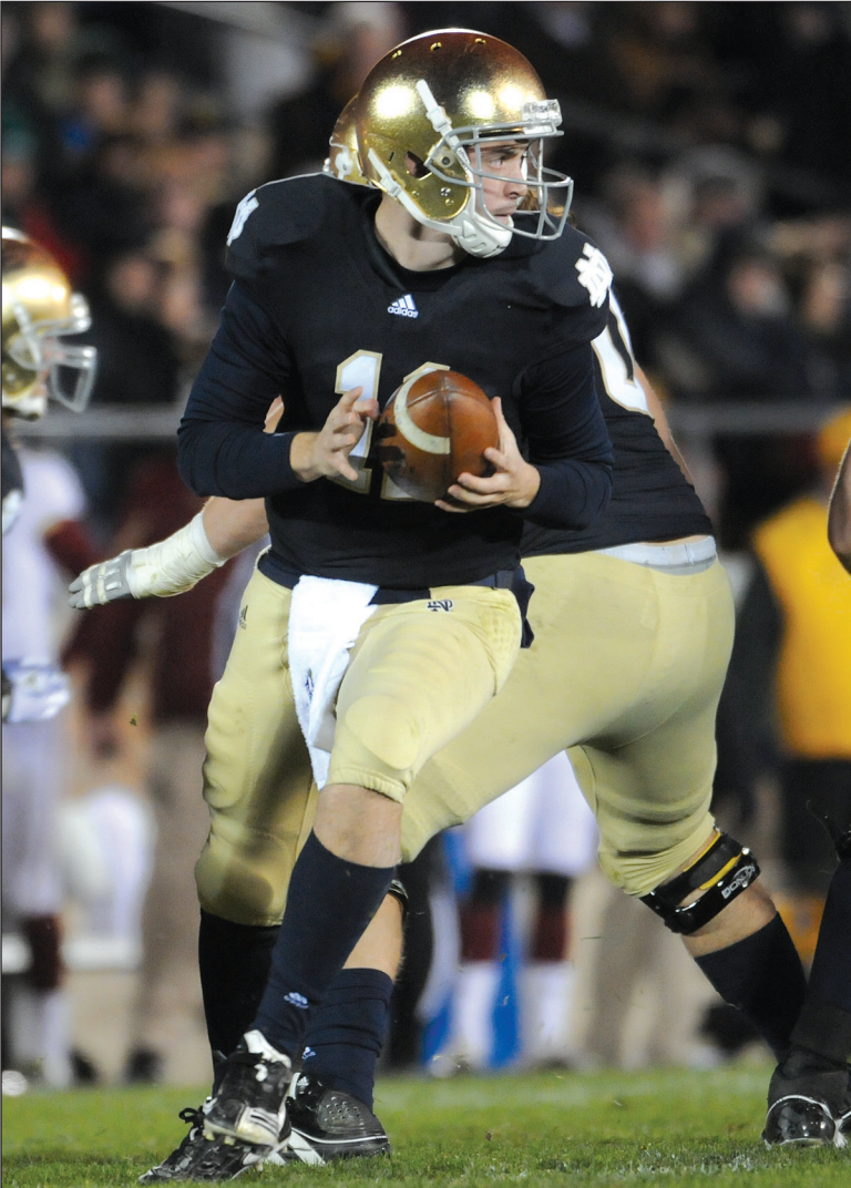
SUZANNA PRATT/The Observer