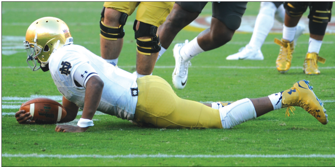
KARLA MORENO | The Observer

"We weren't going to be able to control even if we won out whether we were gonna go to