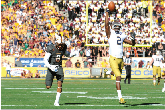
KARLA MORENO | The Observer