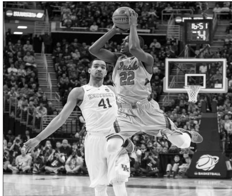
KEVIN SABITUS | The Observer

The views expressed in this column are those of the author and not necessarily those of The Observer.