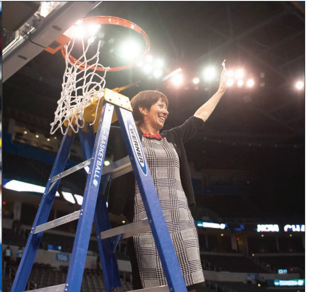
KEVIN SABITUS and JODI LO | The Observer