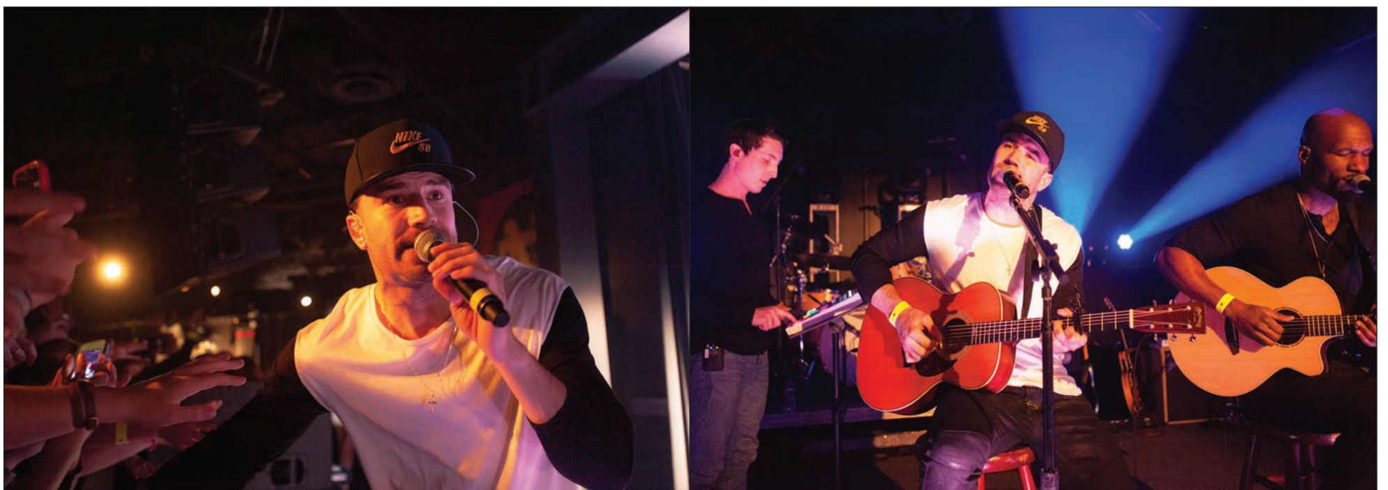
KERI O'MARA | The Observer