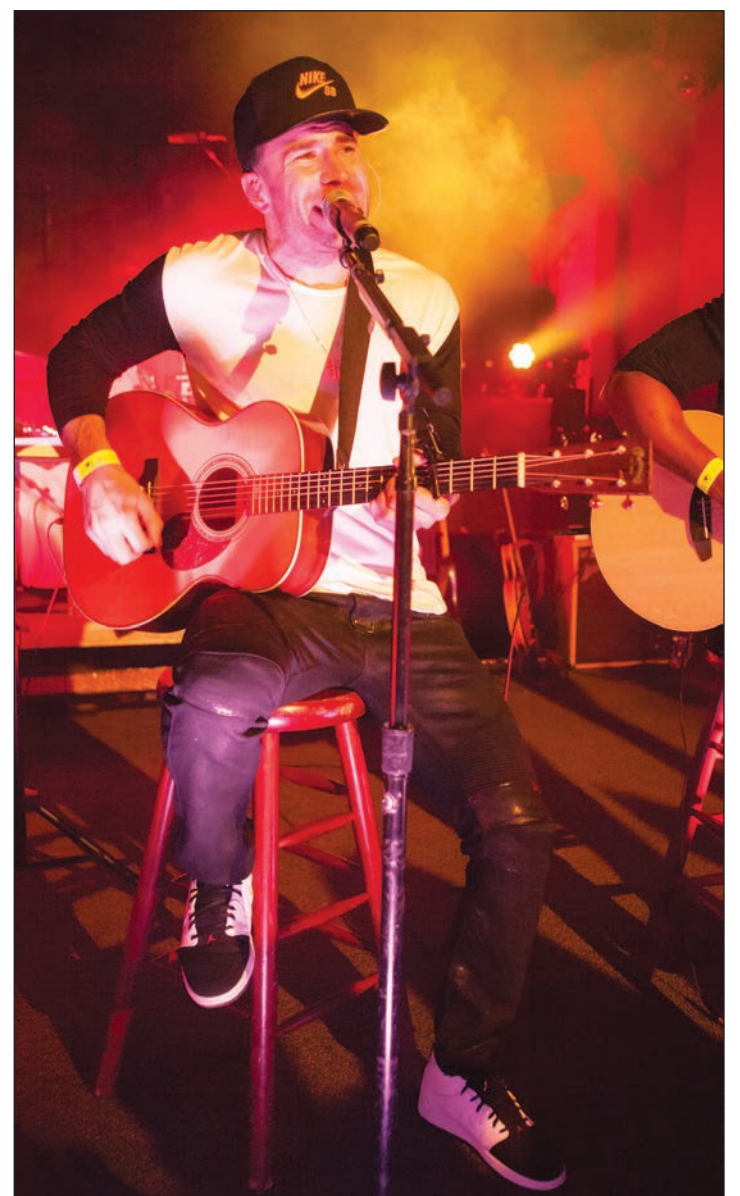
CAITLYN JORDAN | The Observer