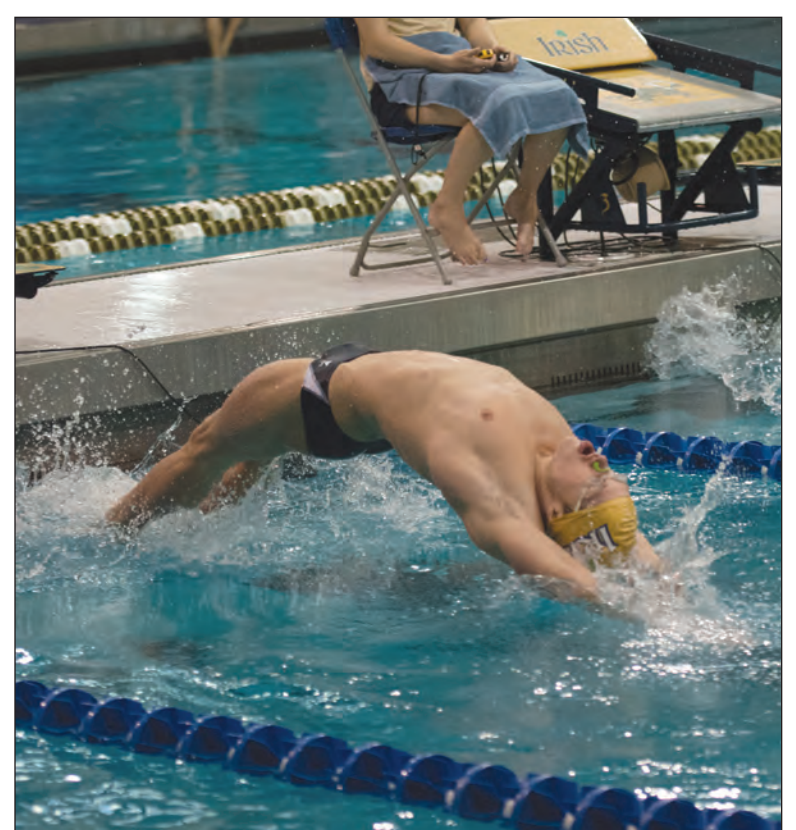
/EI LIN | The Observ