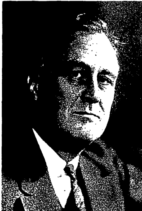
PRESIDENT FRANKLIN ROOSEVELT Heavy Victor in Student Poll.

President Franklin Delano Roosevelt, Democratic nominee for re-election, snowed under his Republican rival, Gov. Alfred M. Landon, almost five to one in the final tabulation of ballots in THE SCHOLASTIC straw vote. Roosevelt received 909 votes, Landon 207. William Lemke and Norman Thomas trailed far behind, Lemke drew 33 ballots, Thomas only 15.