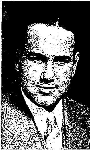
PRESIDENT AL SMITH Brands as you like them.