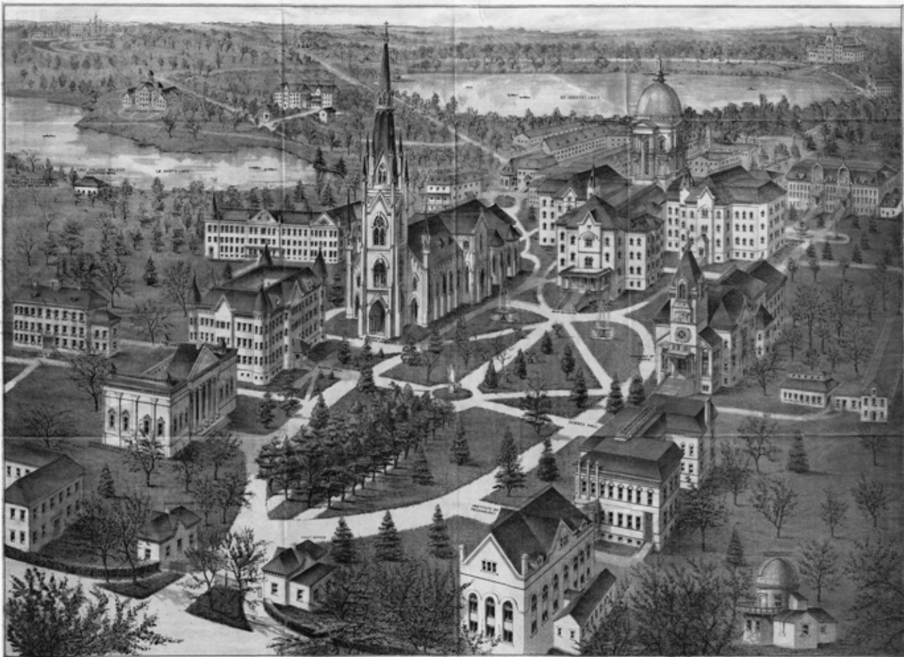
UNIVERSITY OF NOTRE DAME NOTRE DAME IND.