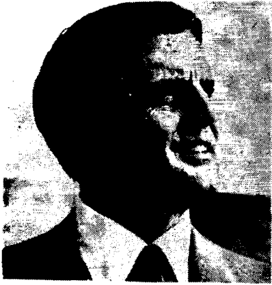
Sen. Walter F. Mondale

Sen. Walter F. Mondale, Democratic Party nominee for vice president, will speak at Notre Dame September 10. His address to Notre Dame faculty and students at 10 a.m. in