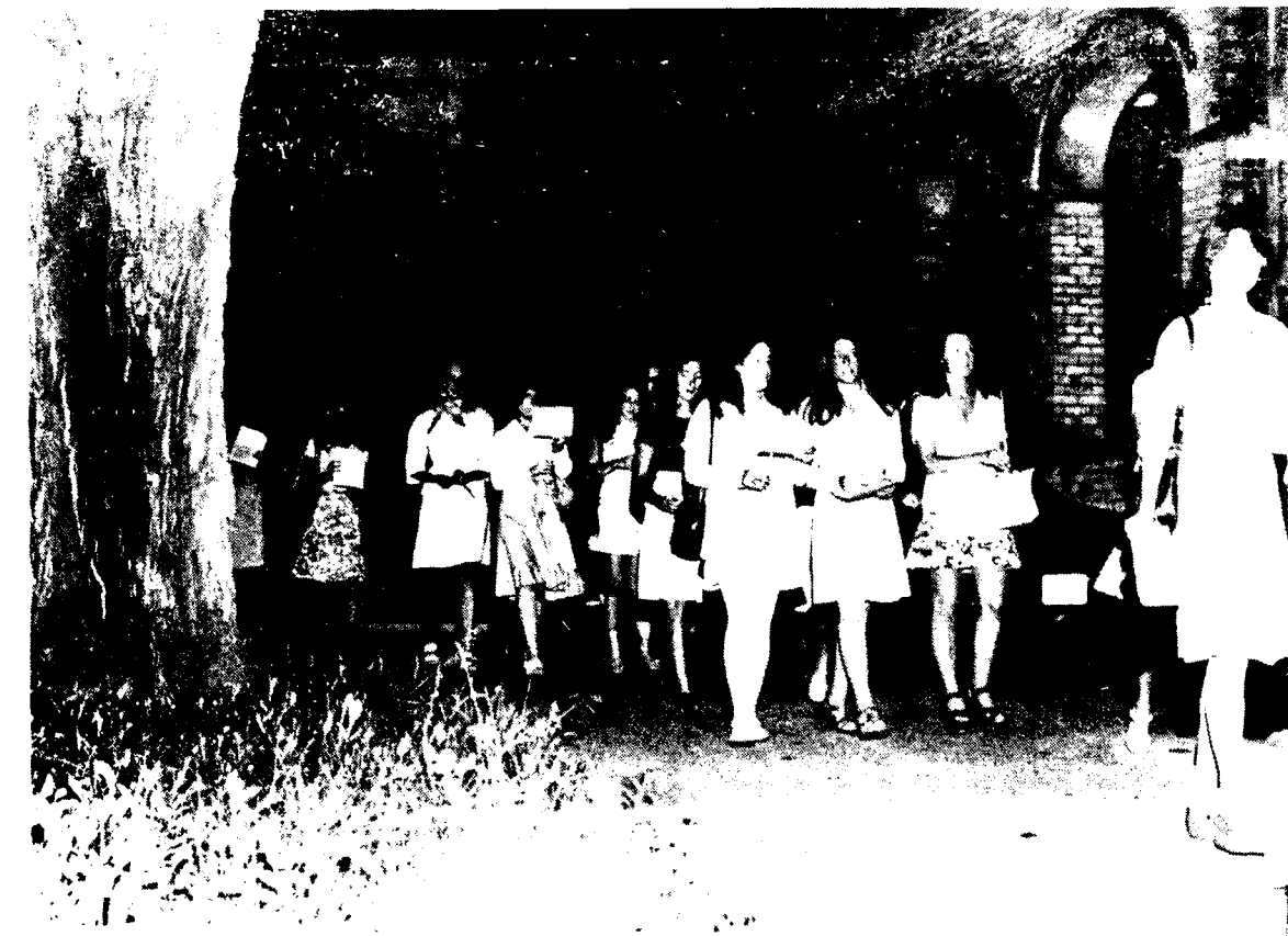
Madonna Night, a traditional event for St. Mary's sisters are leaving the church in a candlelight orientation, took place last night. Here big and little procession.