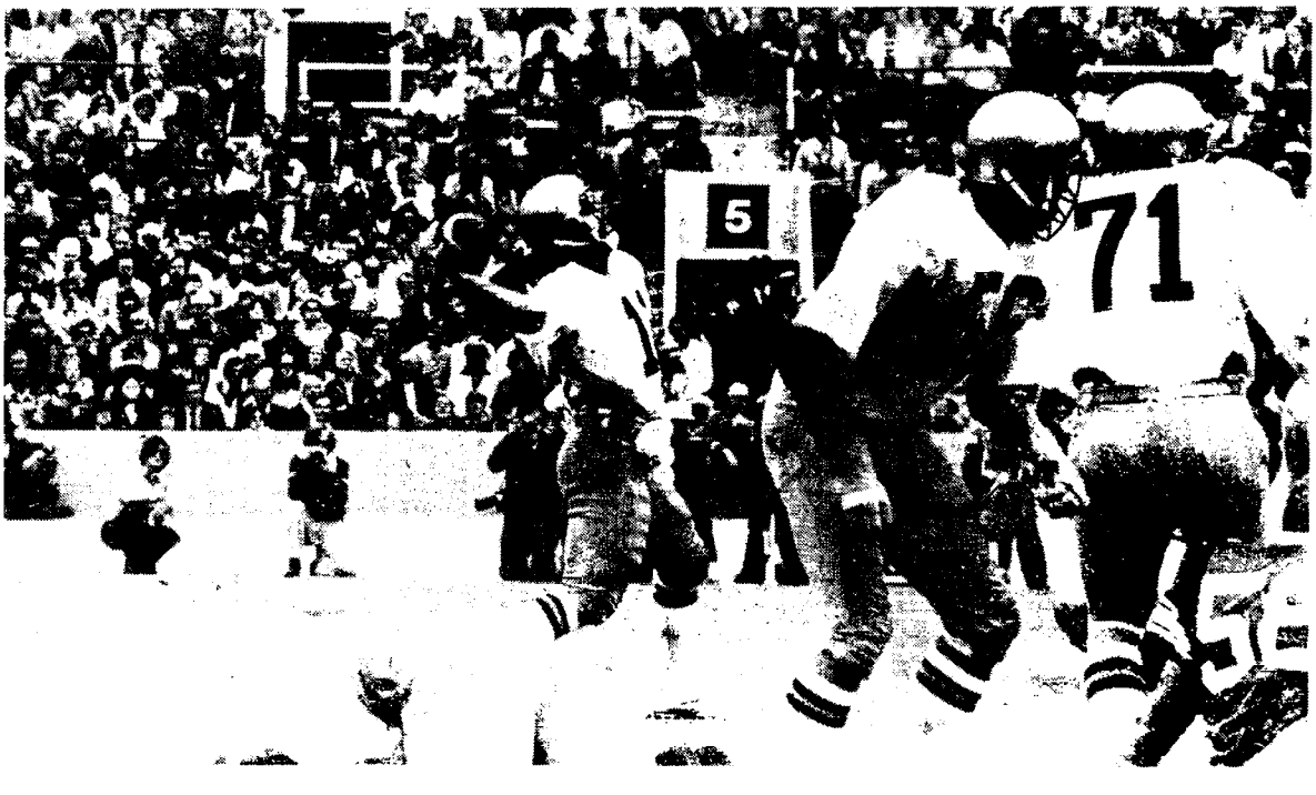
Rick Slager completed a record 12 of 14 passes for three touchdowns Saturday as the Irish took to the road and mauled Northwestern's Wildcats 48-0.

Slager completed the 81-yard dive by flipping a pass to Ken MacAfee raising the score to 35-0