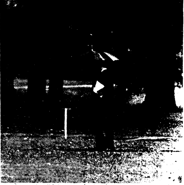
Students who didn't go to the Northwestern game were kept company by a steady rain.

The subject then switched to the planning of a Sophomore dinner at