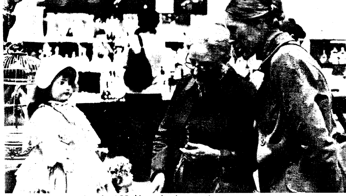
The Antique show held at the ACC this weekend'attracted many students as well as local treasure seekers.