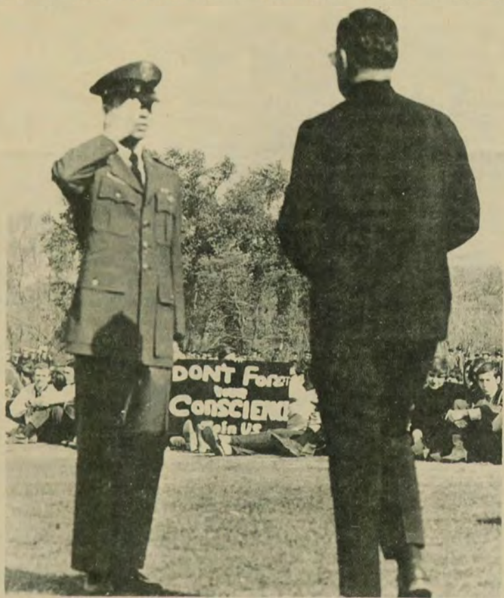
Pressure from various segments of the Notre Dame community caused ROTC's role in freshmen orientation to be toned down this year. Last year the Presidential Review was cancelled.