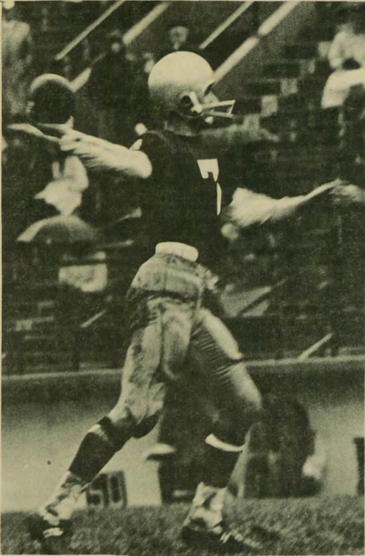
If Joe Theismann is lost through an injury, it may be a long, tough season for the Irish.

Bleier did, however, send a letter to Steeler owner Art Rooney wishing the team good luck and saying that he would be fully recovered.