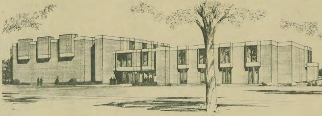
LIFE SCIENCE CENTER · UNIVERSITY OF NOTRE DAME, NOTRE DAME, INDIANA

Contracts for the building totaled $3,673,690. Major contractors are Fred Black Construction Co., and Morse Electric Co. Architects for the project are Ellerbe Architects, of St. Paul, Minn.