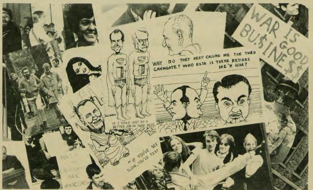
Observer collage by Phil Bosco