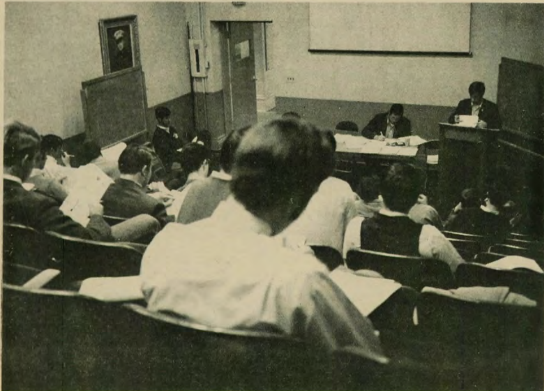
The Student Senate met briefly last evening.

The business clubs set to be erased from the student government budget include the Finance Club, the Finance Forum, and the Marketing Club. They had asked for a combined total of $3,035.