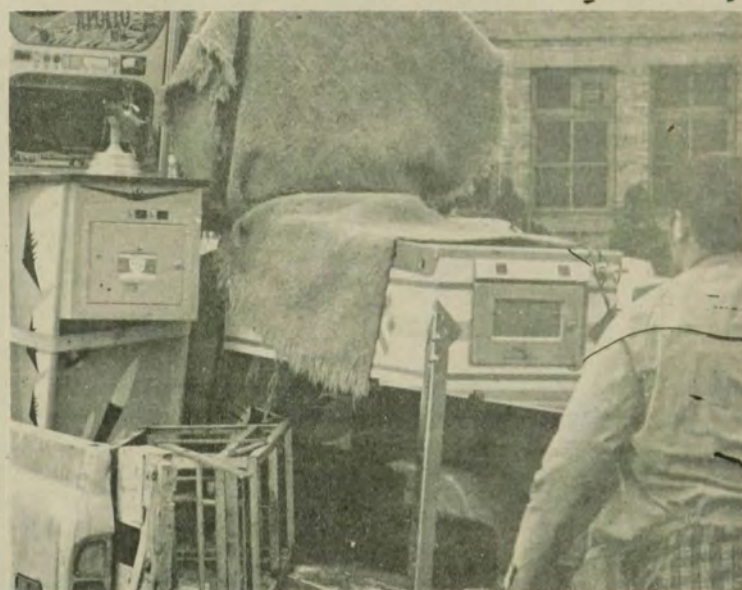
The Huddle's infamous "death machines" were removed after precipitating a violent demonstration by SLERT and CYO members yesterday.

This touched off intensive fund raising efforts by the group, which are still going on, as well as beginning the renovation of the newly named University Arts Center.