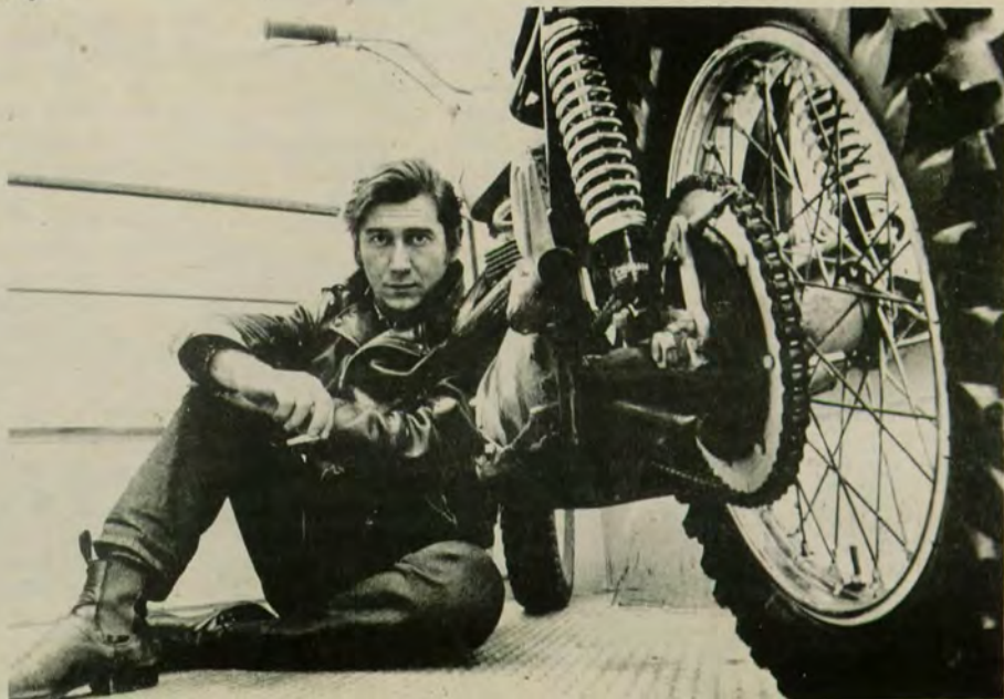
The masculine American man.