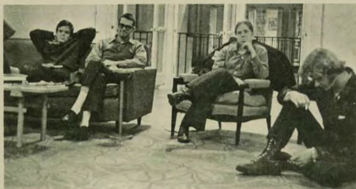
CPA members discuss plans for Complicity Week.