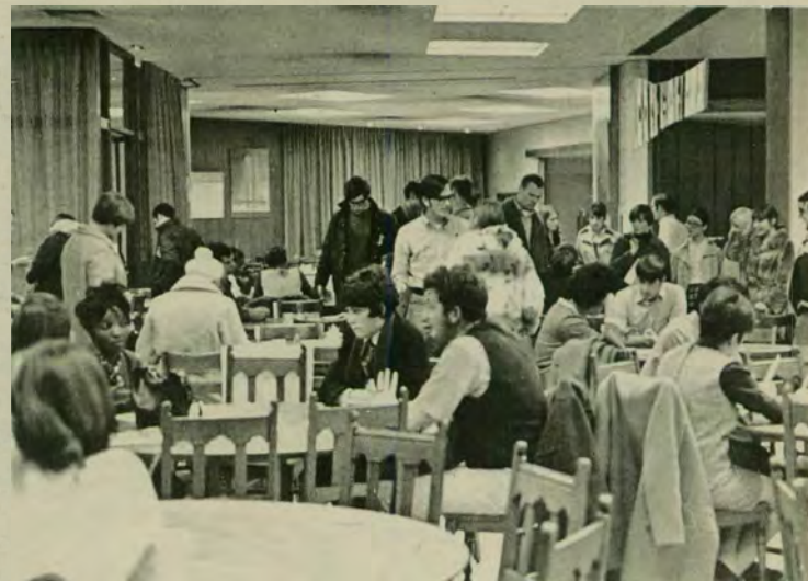
ND-SMC students were informed about local service agencies at the Volunteer Services night held at Saint Mary's.