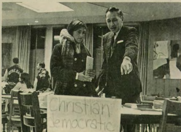
Volunteer Services Inc. met at Saint Mary's yesterday.