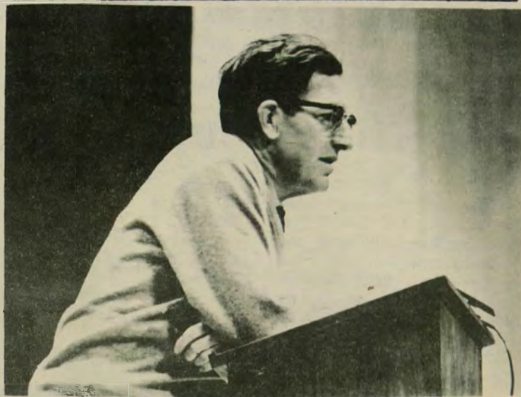
Goodman: "The school system should largely be dismantled, not reformed."