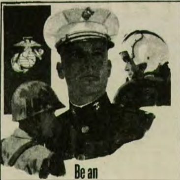
The Marine Officer selection team will be on campus 17 to 20 February in the South Dining Hall