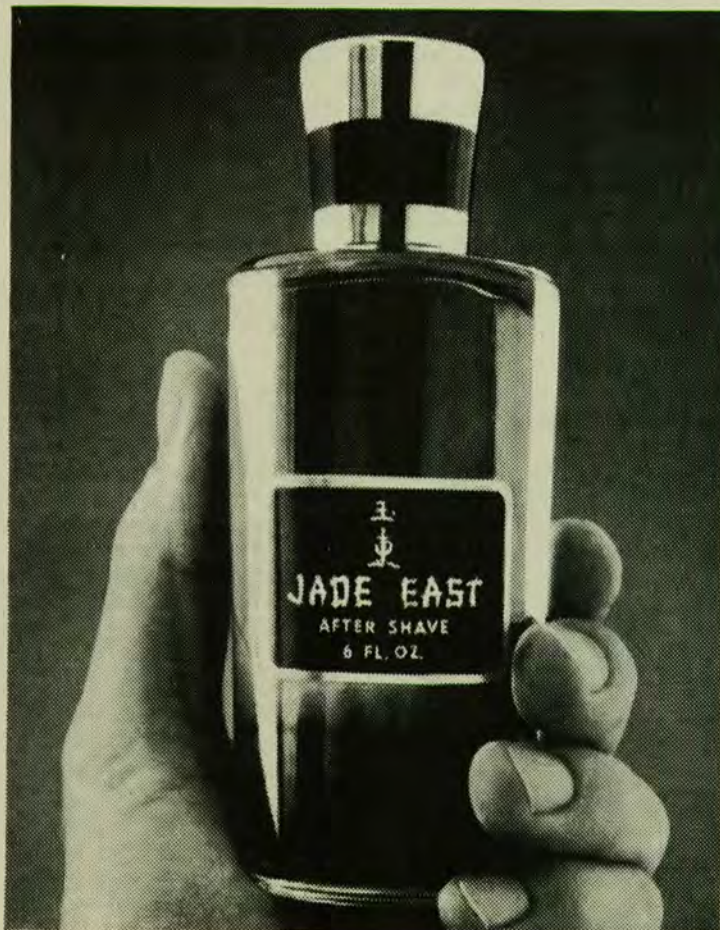
Jade East After Shave and Cologne.