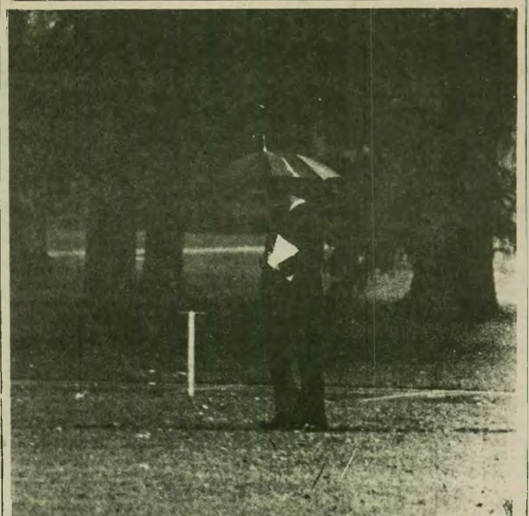
Students who didn't go to the Northwestern game were kept company by a steady rain.

The subject then switched to the planning of a Sophomore dinner at