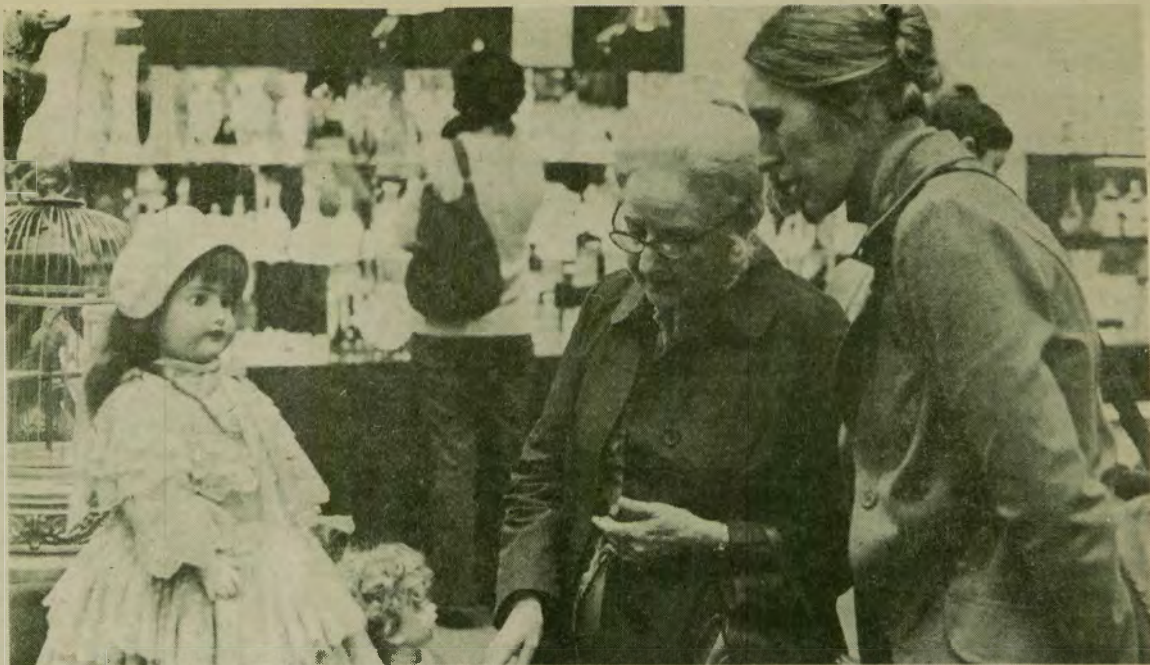
The Antique show held at the ACC this weekend attracted many students as well as local treasure seekers.

"We wanted to let students experience people from a different culture and class, to see their dependence, their despair, and then to ask questions about the U.S. and its relations. We wanted students to experience the church in a different way, to learn why the Holy Cross priests are there, and lastly, we wanted students to learn through working; to pursue interests and share experiences with