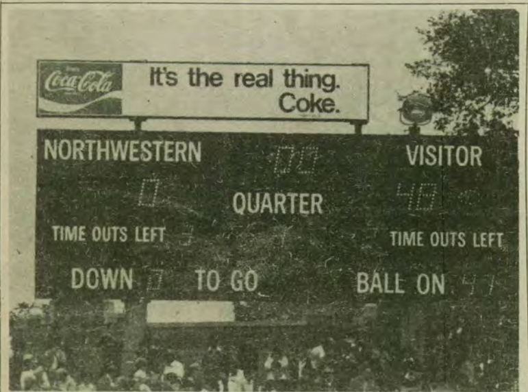
The fighting Irish football team closed out the Northwestern series with a convincing 48-0 victory over the Wildcats. For details, see page 8.

Vol. IX, No. 19 an independent student newspaper serving notre dame and st. mary's Monday, September 27, 1976