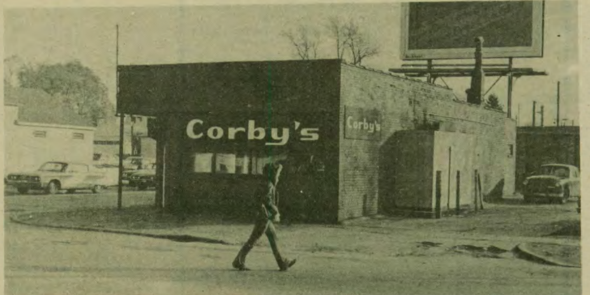
Corby's, a student bar located at Corby and Eddy streets, will close before the end of February. The property owners will not renew the management's lease.