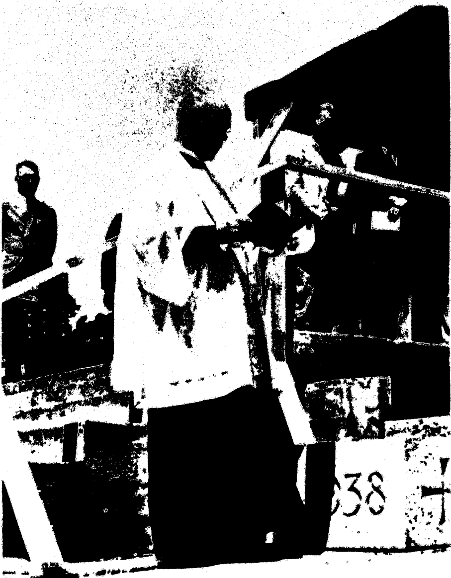
As President of the University at cornerstone laying of Rockne Memorial.