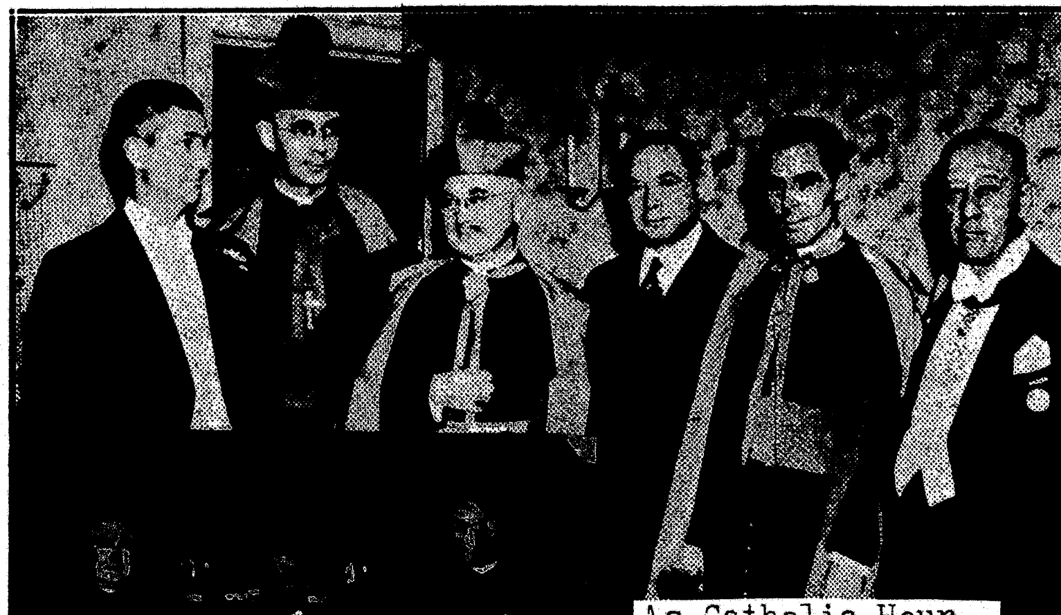
As Catholic Hour marked its Tenth Anniversary