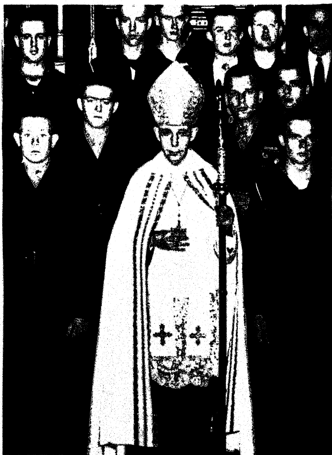
As Military-Delegate to the Armed Forces