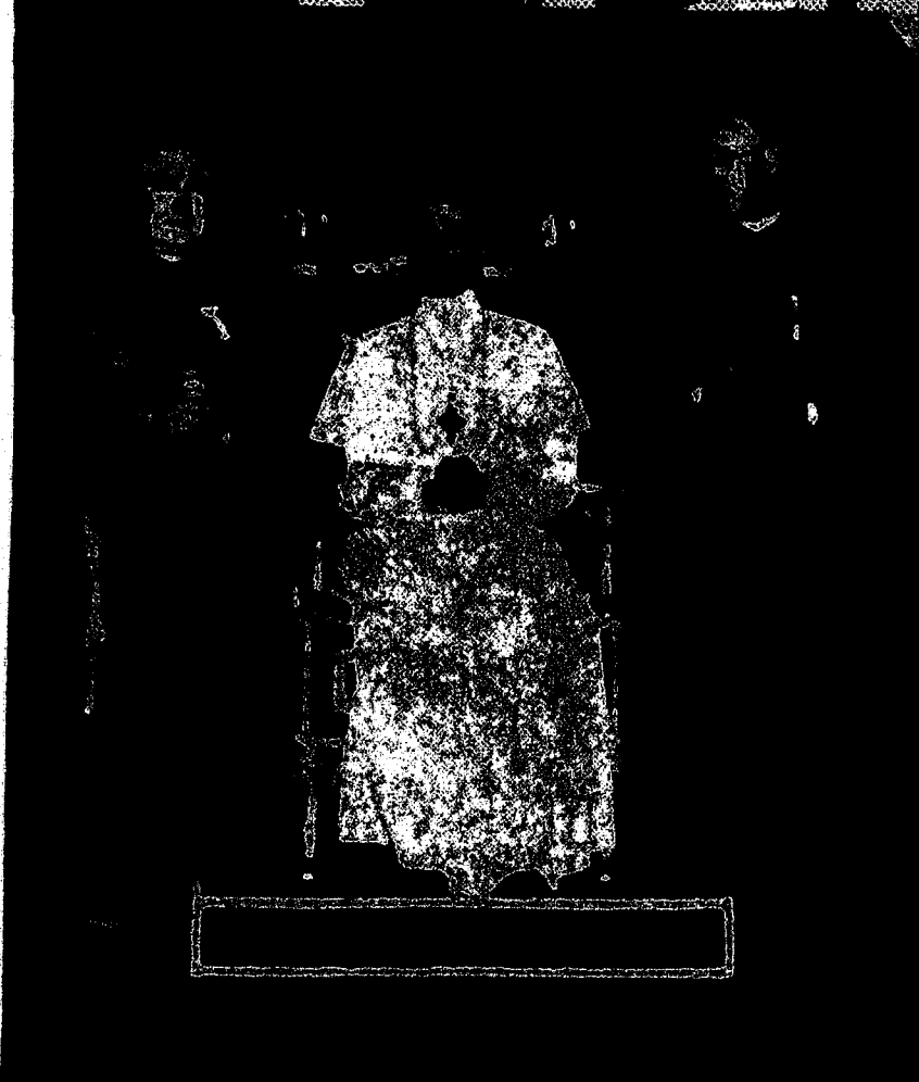
At the Vatican with Cardinal Spellman and the Holy Father