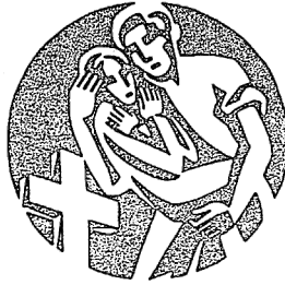
Giving Christian burial to the dead