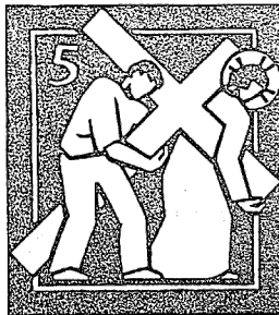
11.5 Simon of Cyrene carries the Cross. (Matthew 27:32)