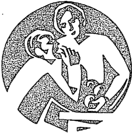
Serving meals to the hungry