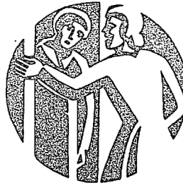
Giving shelter to stranger and homeless