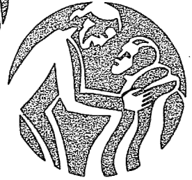
Making and giving clothes to those in need