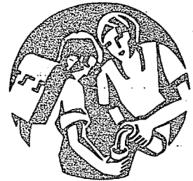
Giving drink to the thirsty