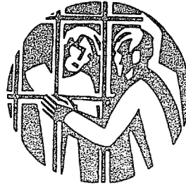
Visiting the prisoner in jail