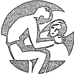
Visiting and nursing the sick